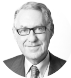
David Gonski AC