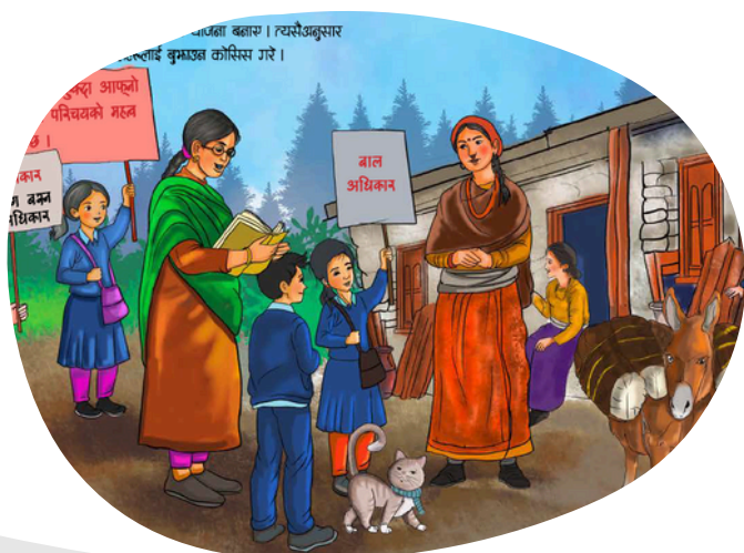
A page from the children's book Adara is publishing in partnership with The Himalayan Innovative Society