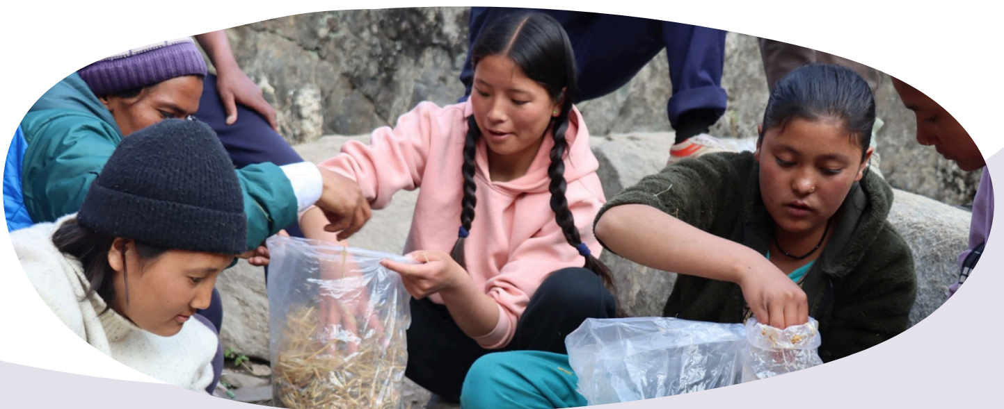
Photo: Agricultural Education students at the Yalbang School