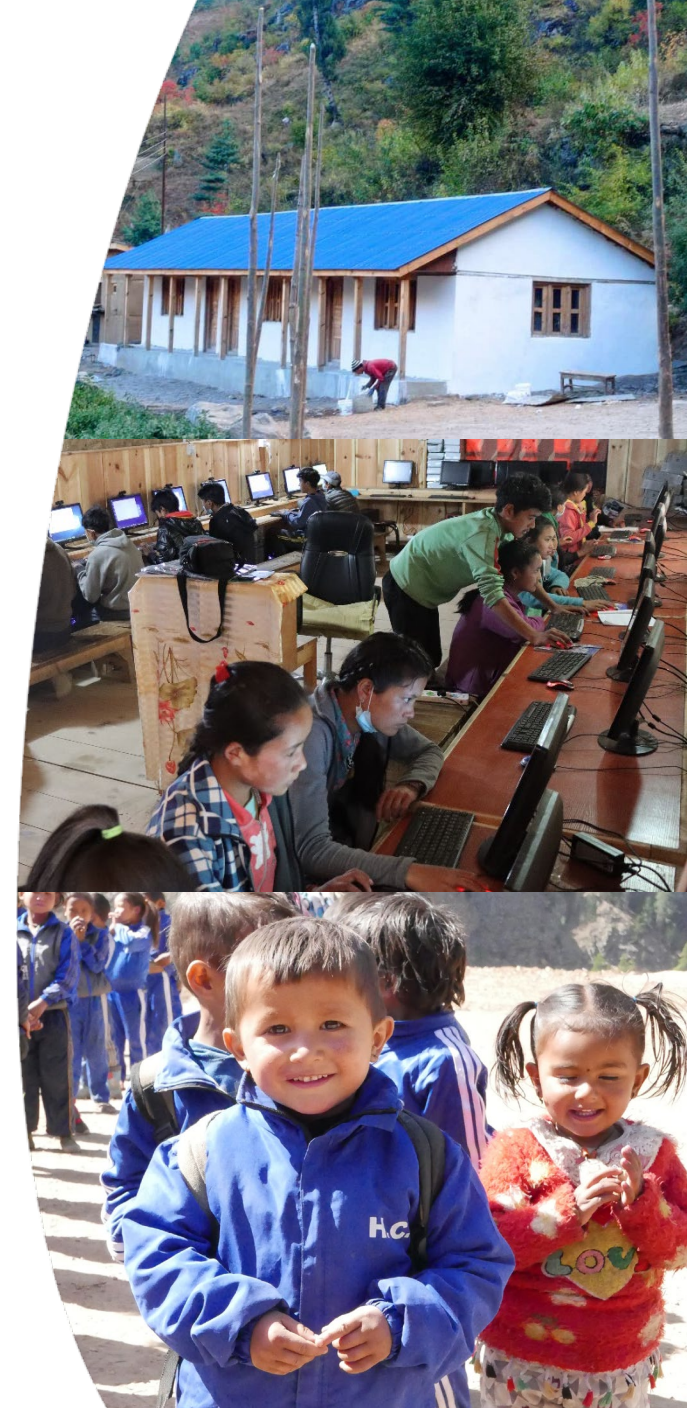
Photo: newly constructed Santa School classrooms; Yalbang students attending computer class; young boy attending school in Humla.