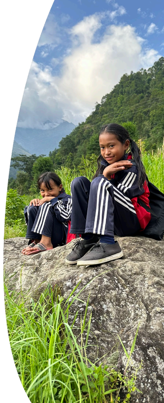
Photo: students on their way to school in Ghyangfedi.

In early 2024, Adara also recruited a Child Protection Coordinator to oversee child protection across all areas of our programmes in Nepal. Primarily based in Humla, they will strengthen child protection systems in all Adara-supported schools, and within the community and government. We'll share more on this in your next report.