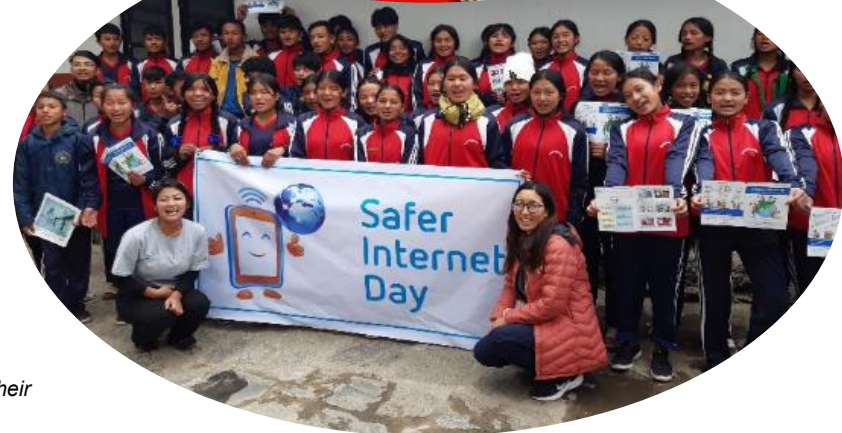
Photos: students already using the innovation centre at Shree Ghyangfedi School; students happy learning; students after their internet safety workshop.