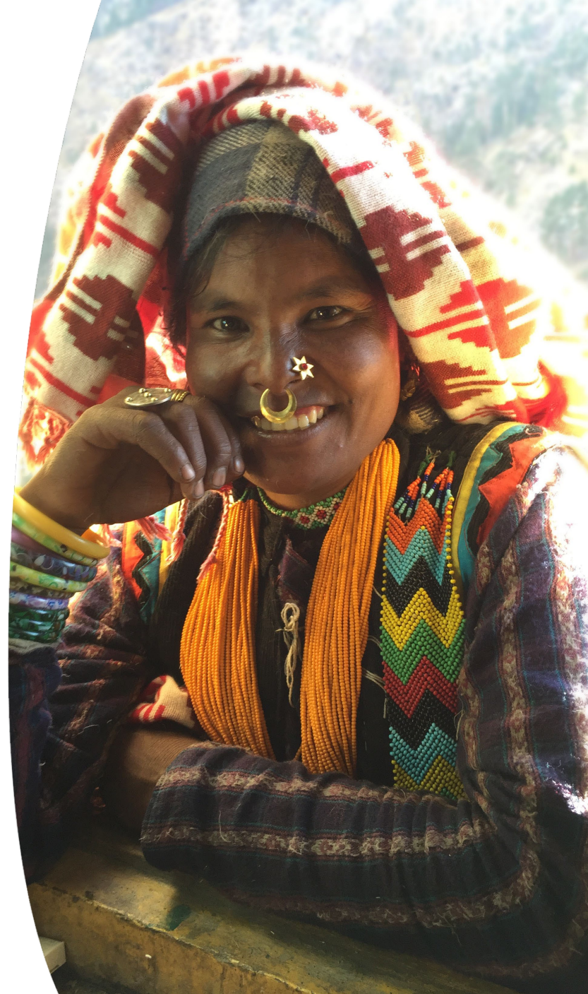
Photo: a women in Humla.

Words cannot explain how grateful we are for your ongoing support. We are all in this together. Thank you!