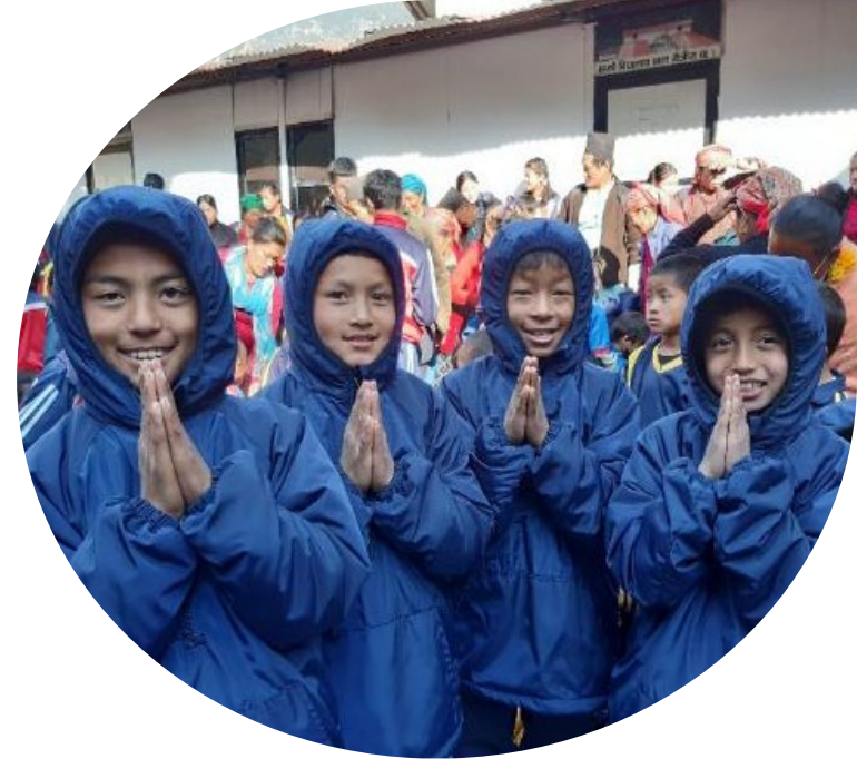
Photo: students wearing their new jackets at Shree Ghyangfedi School.