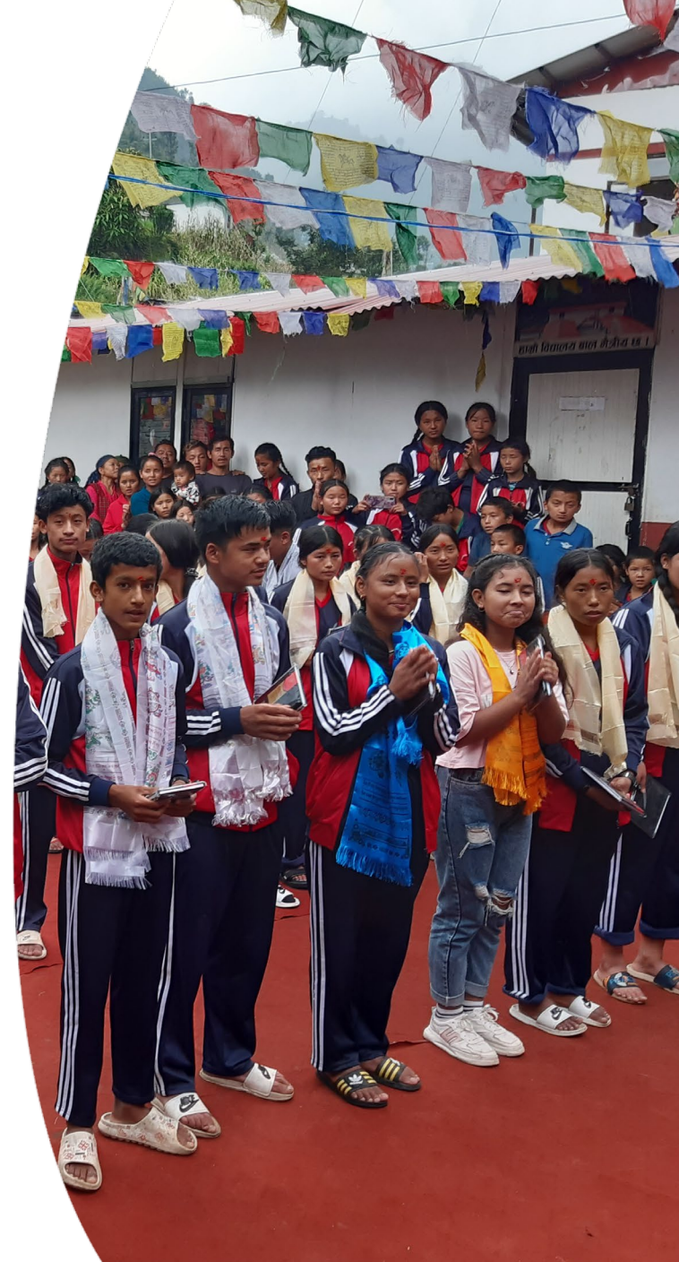
Photo: welcoming a new batch of Plus Two students to Grade 11 at Shree Ghyangfedi School!