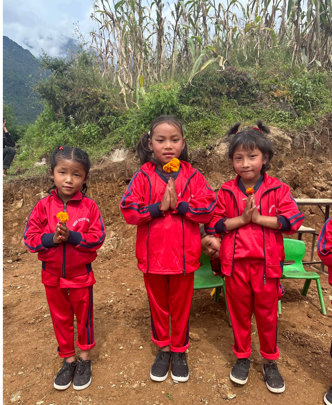
Photo: young students from one of Adara's feeder schools in Ghyangfedi.

This work is possible thanks to your incredible support. Thank you for standing with us and remote communities living in poverty!