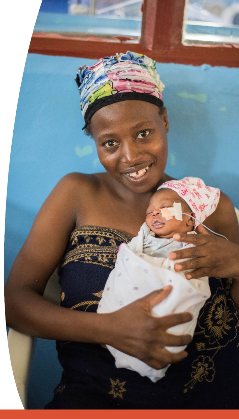
Photo: A mother and her newborn in the Kiwoko Hospital neonatal intensive care unit.