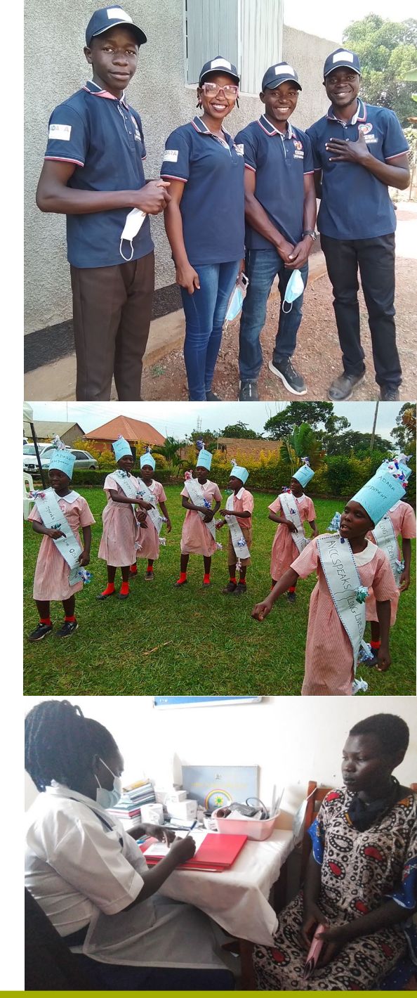
Photo: AYCC Peer Educators; students delivering a drama performance about the centre; a young women accessing AYCC health services.