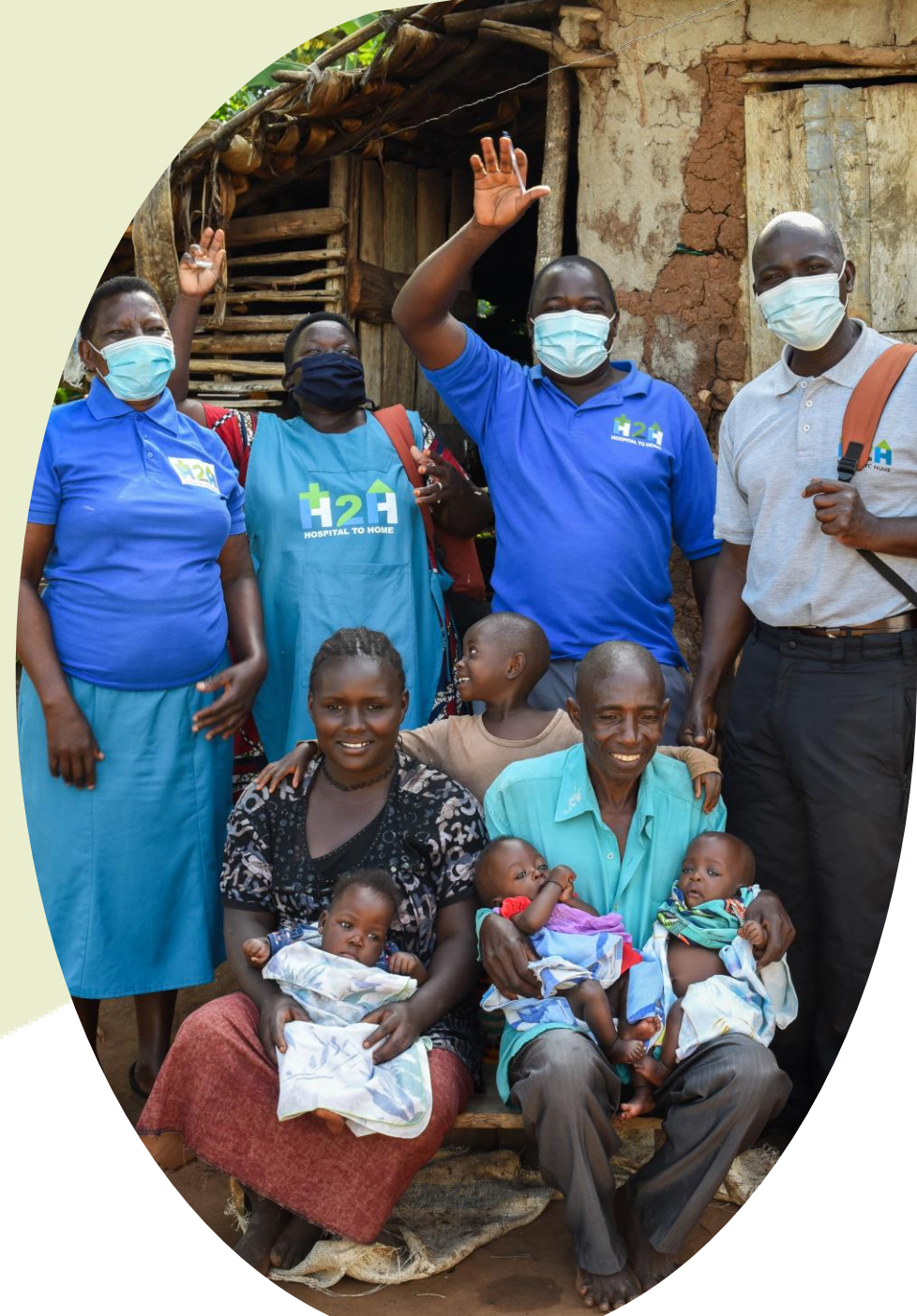
Photo: Family and their premature triplets being visited by Adara's Hospital to Home team.