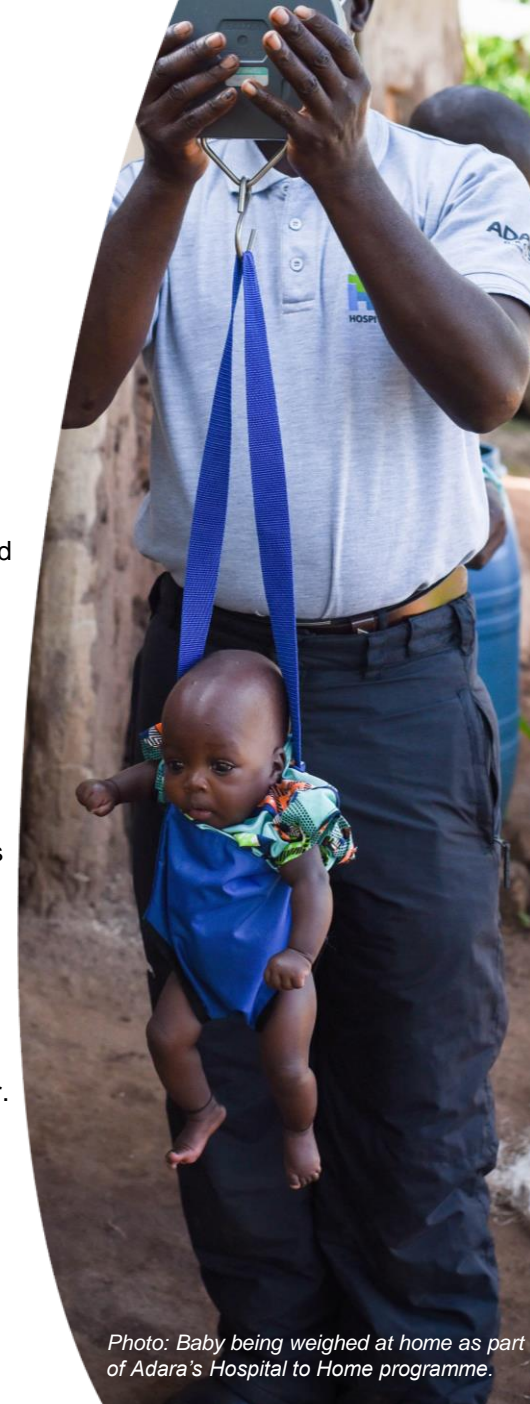
Photo: Baby being weighed at home as part of Adara's Hospital to Home programme.