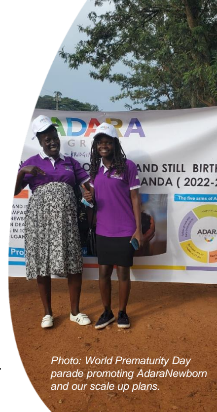
Photo: World Prematurity Day parade promoting AdaraNewborn and our scale up plans.