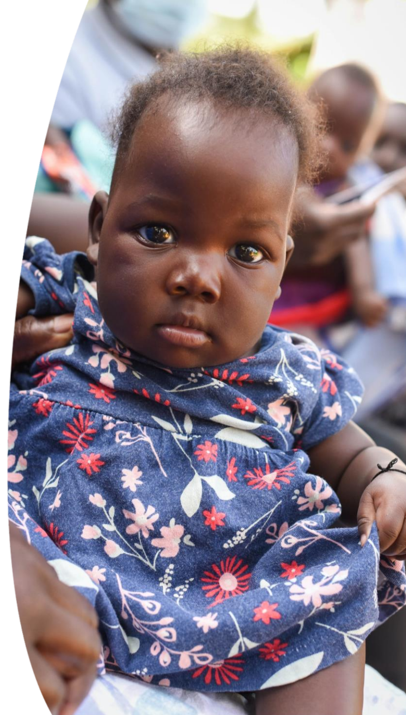
Photo: Baby visited through Adara's Hospital to Home programme – now healthy and thriving!