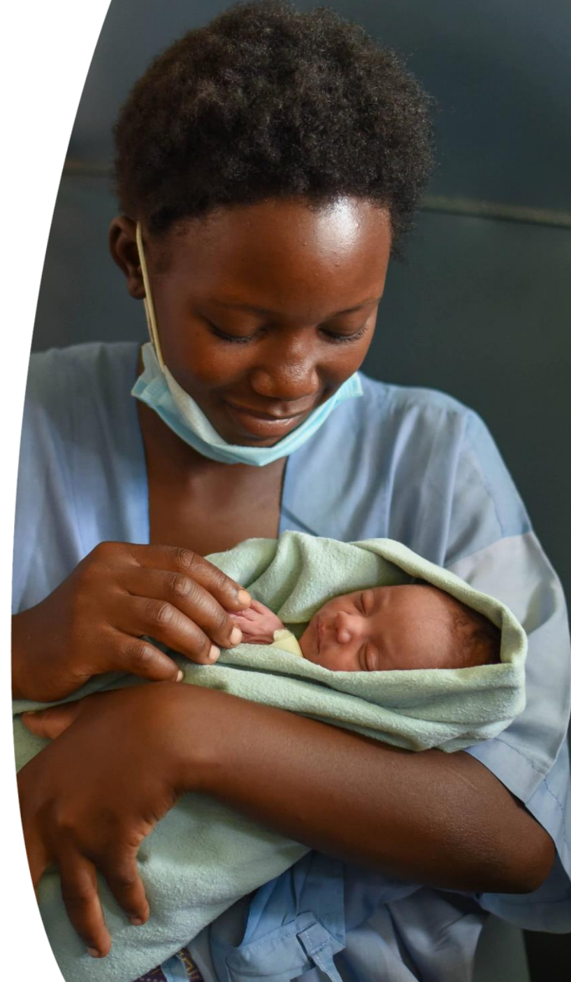
Photo: Mother with her baby in the Kiwoko Hospital neonatal intensive care unit.

Thank you for standing with us as we continue to strive toward our goal to reduce maternal, newborn and child deaths and to improve the health and wellbeing of communities. Together, nothing can stop us.