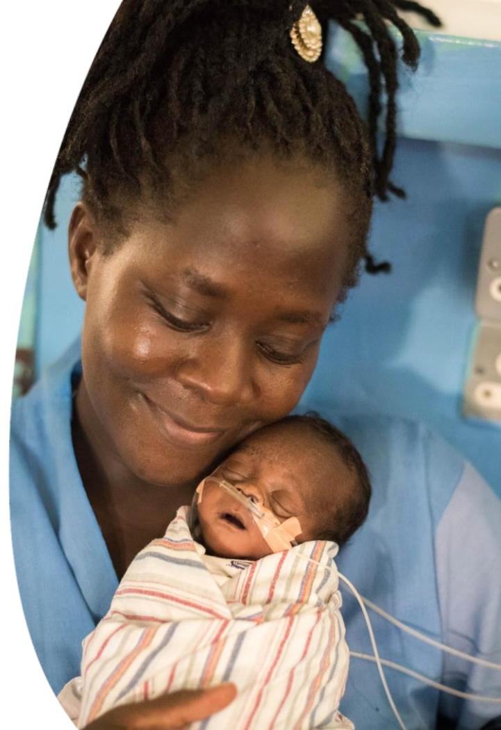
Photo: Nurse in Kiwoko Hospital neonatal intensive care unit.