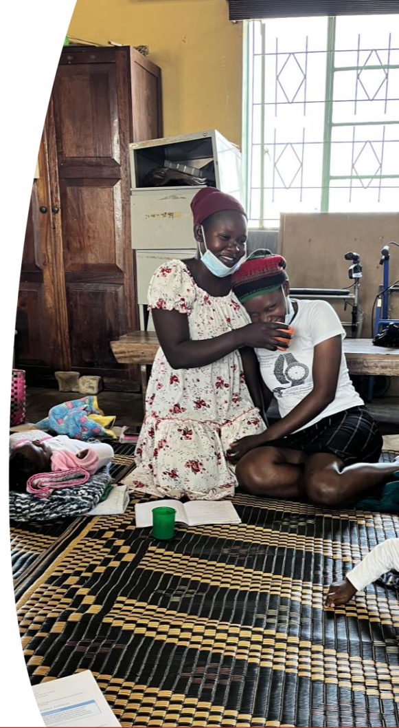
Photo: two mothers joking together during a water drinking exercise in a Baby Ubuntu session, July 2022.