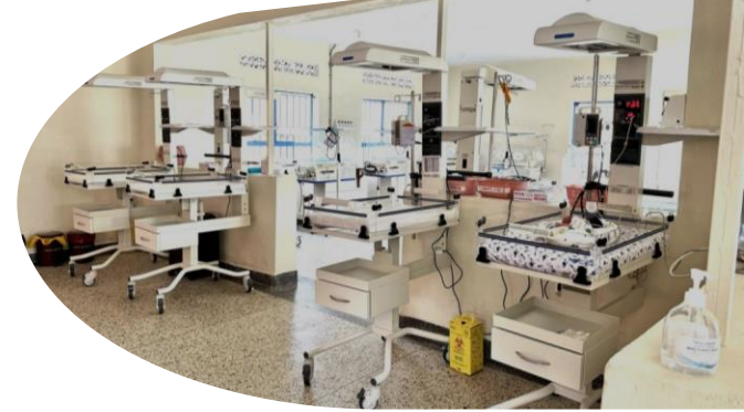
Photo: Nakaseke Hospital special care baby unit.

The quality of the road between Nakaseke and Kiwoko Hospitals is poor and makes transferring mothers and babies to Kiwoko Hospital extremely hazardous and slow. We will continue our work to equip staff at Nakaseke with the knowledge and skills they need to treat at risk mothers and babies there to reduce referral numbers.