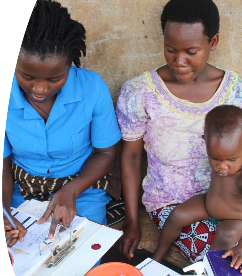
Photo: A mother and her baby at a Safe Motherhood Clinic in the community with a community health worker.

Every Thursday, Adara runs a radio programme via a local radio station to raise awareness about health issues such as COVID-19, HIV/AIDS and common childhood illnesses. The programme aims to encourage health-seeking behaviours and promote available health services including Safe Motherhood Clinics, Hospital to Home, Baby Ubuntu, the Adara Youth Community Centre.