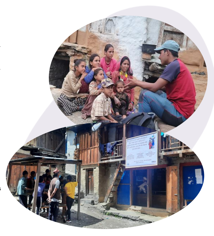
Photo: A THIS Social Worker in action (top), an anti-trafficking message board installed by THIS (bottom).

Despite the increased risk of child trafficking during times of crisis and economic insecurity, there have been no reported cases of child trafficking in Humla between July-December 2021.