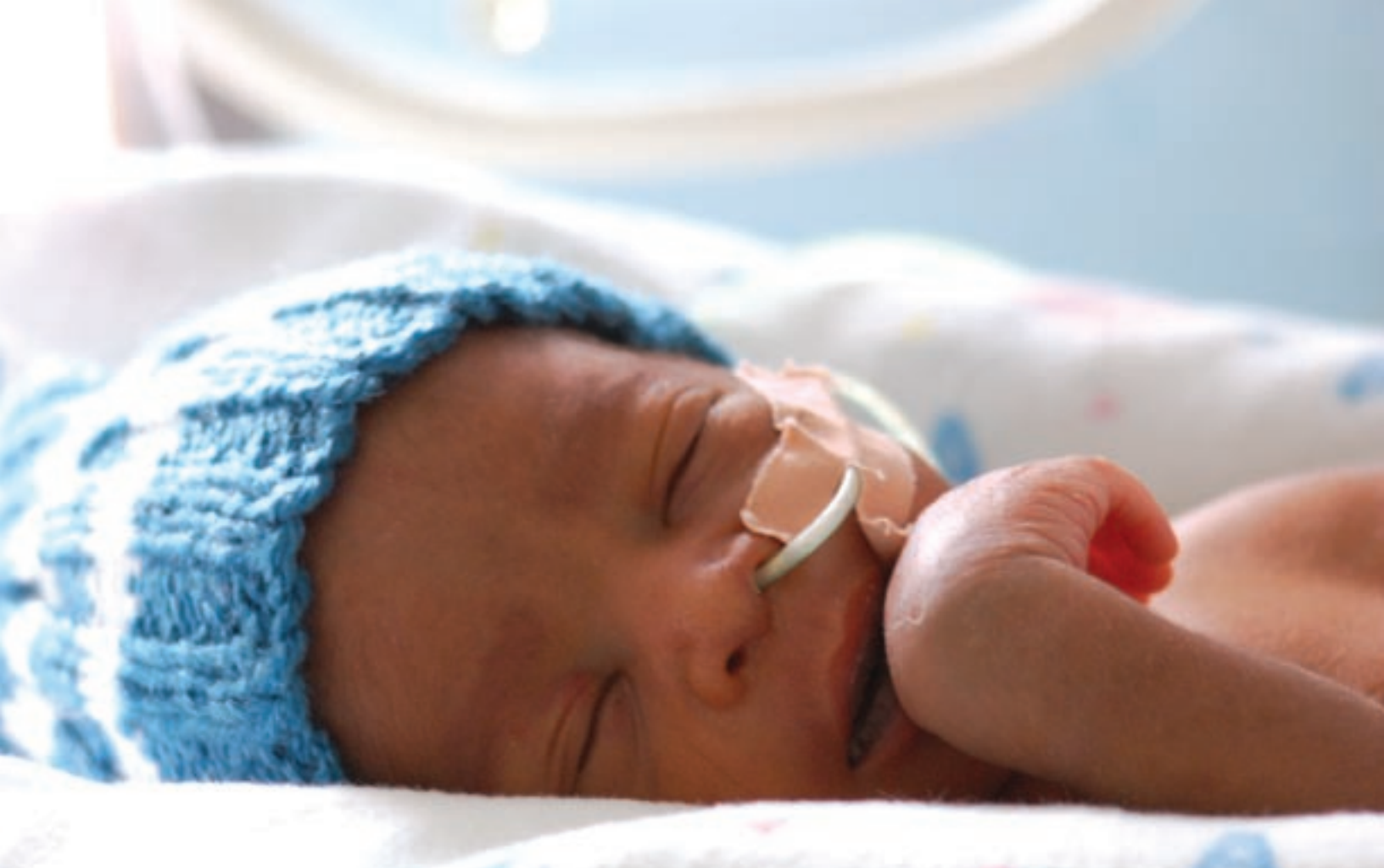
Clockwise from top left: Another tiny NICU patient with a cap knitted by generous donors; Mums sitting in front of the generator we bought, with photos of their babies, all of whom are in the NICU; local kids; some of the boys from the Ebenezer Club.