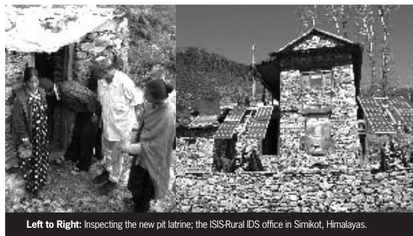
Left to Right: Inspecting the new pit latrine; the ISIS-Rural IDS office in Simikot, Himalayas.

Our work in Humla is kindly and generously supported by the Kadoorie Charitable Foundation and the American Himalayan Foundation .