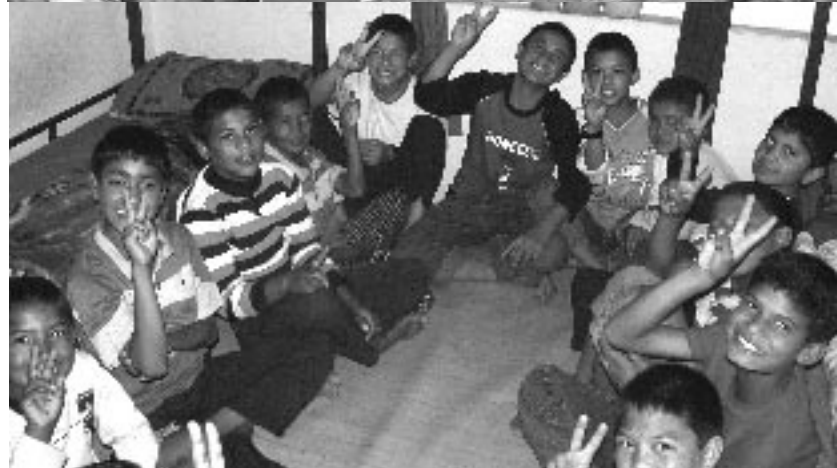
Clockwise from top: A young boy at one of our ISIS homes; kids from ISIS V – Park Village home; two girls now in ISIS III – Bansbari Girls home; kids in ISIS II – Harti Gauda home.