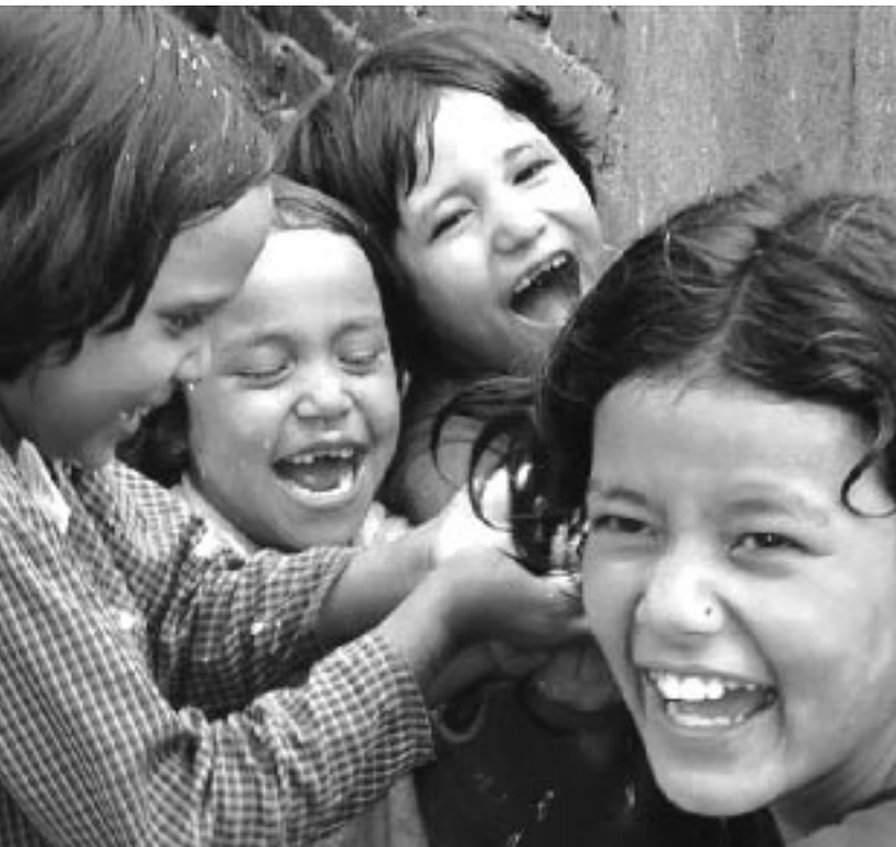
Clockwise from top: Some of the girls now in ISIS homes; a young Upper Humli girl from one of the 10 ISIS Homes; shoes and slippers at the door of one of our homes.

Our involvement with children who were in the hands of child traffickers began over three years ago. We began to hear tales from the Humli communities we work with in the Himalayas in North West Nepal, of parents desperately trying to get their children out of the mountains and away from the dangers of being caught up in the civil war raging in the high Himalayas. The security situation there had been so precarious that parents were sending their children down to Kathmandu to try to ensure their safety, and avoid their use as child soldiers by the Maoist armies. This desperation opened the door to child abusers and profiteers.