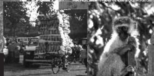
Clockwise from left: Locals in Kiwoko; Outpatients Department; Sister Immaculate, the head of the Nurses Training School, and Jaja; Leo's monkey; a novel way to transport mattresses!

In 2006 we continued to support the Neonatal ICU (see Pg 24-26), and in addition, we supported the hospital to achieve the following outcomes for local people: