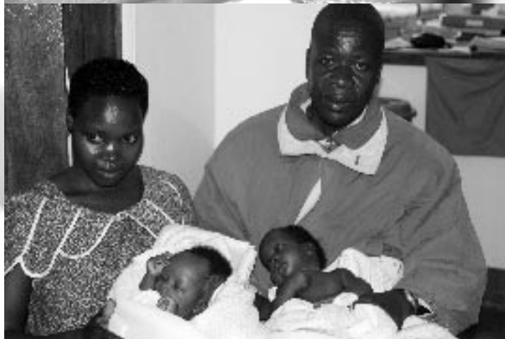
Patients and parents in the Neonatal Intensive Care Unit.